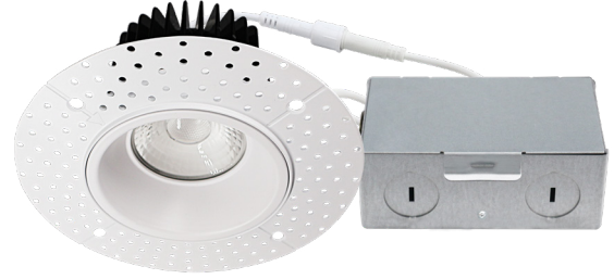
RLF-4515-RTL-UNI-SW5-WH complete set

LED Trimless Downlight series is designed for residential and commercial applications. With contemporary trimless look and an ultra shallow profile of merely 2-1/2" deep coupled with IC rating, this Slim Downlight is perfect for tight spaces such as soffits, insulated and suspended ceilings as well as installations directly below ceiling joists. The fixture installs flush to ceiling, it includes the Remote Driver and housing is not required for remodel applications. The mounting frame with hanger bars is optional for New Construction applications. The 5-level field selectable color temperature is available.